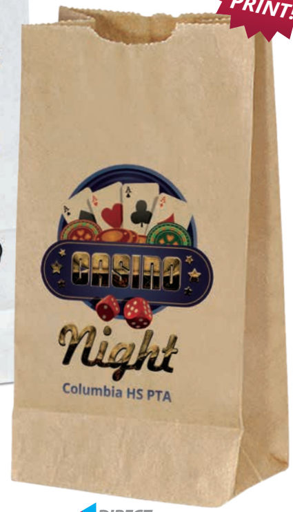
POPCORN BAGS White, Brown, and Colors